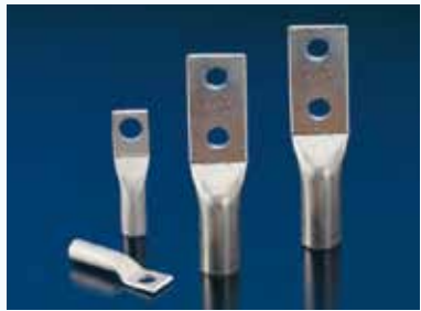
Terminal material: Copper