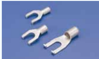
1501 折角 Y 型端子 FLANGED SPADE TERMINAL