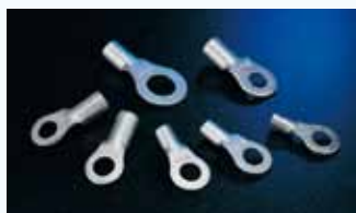
1501 R 型端子 RING TERMINAL