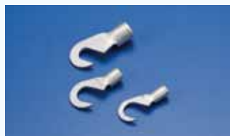
1501 鉤型端子 HOOK TERMINAL