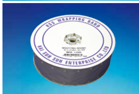
cut-to-fit versatility in convenient roll-form